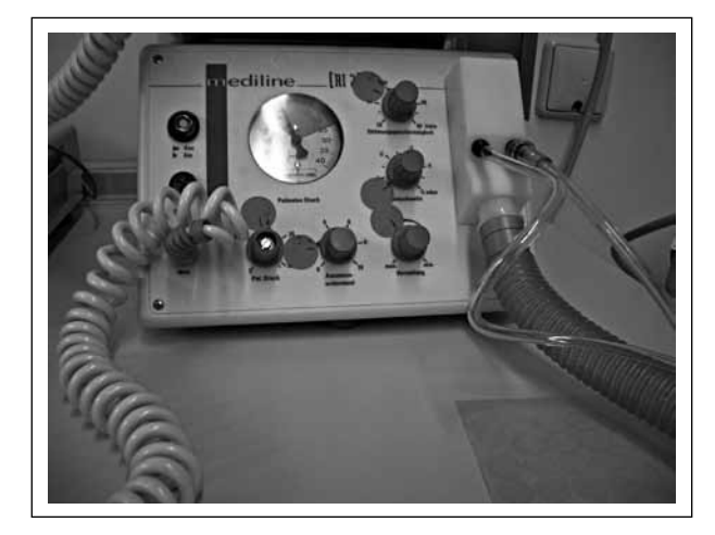
Figure 2. The Mediline Ri2<sup>®</sup> device for IPPB intermittent positive pressure breathing.

(Intermittent Positive Pressure Breathing). The advantage of this method is that no-one is usually required to assist. The boy is able to position the tube of the apparatus via mouthpiece or mask, and also to start or stop it by a push-button, all without assistance (Fig. 2). Inhalation solutions like beta-sympathomimetics or corticosteroids, or just 0.9% to 5.85% sodium chloride solution can be nebulized for mucolysis. Periodic breathing training may continue for up to 5 yrs, until vital capacity values are so low that assisted ventilation becomes necessary.