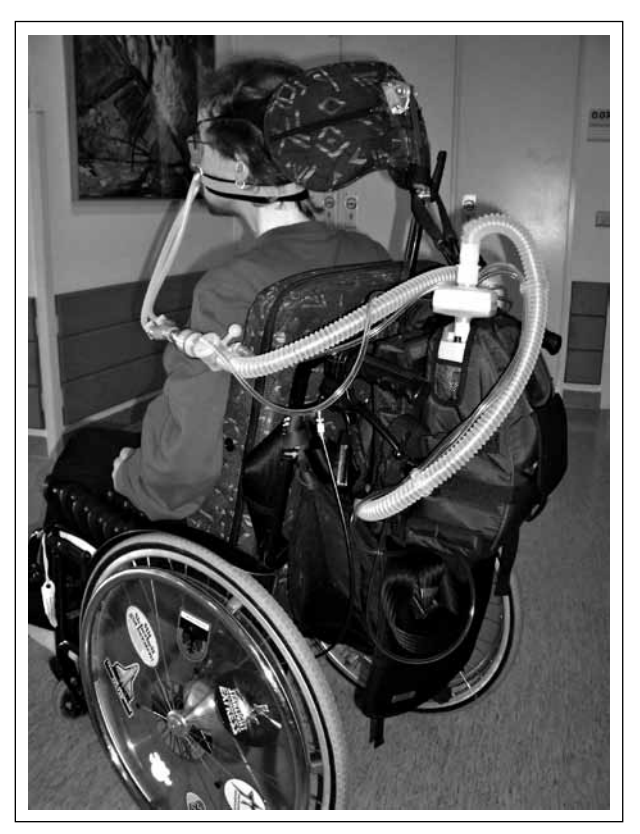
Figure 4. Duchenne boy on 24-hrs non-invasive ventilation using a mobile Legendair<sup>®</sup> ventilator with internal and external energy supply.

Home ventilation was already widespread in France (26), Great Britain (27), Italy (28), the Netherlands (29), Belgium (30), Denmark (31), and the USA (32) when it finally also triumphed in Germany. It was first used in hospitals that had patients with par-